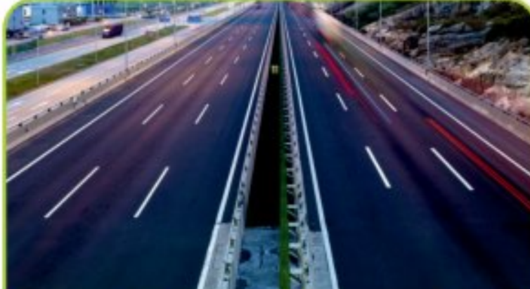
4line Express Highway Road